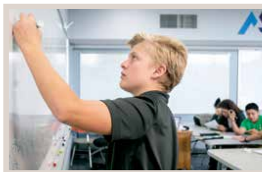
Math Academy students spend most of their class time out of their seats, working at whiteboards around the classroom

Starting in sixth grade, Math Academy students complete high school math in middle school, and advance to college-level math in high school. With the support of Arroyo Capital, Pasadena Education Foundation, and other funders, Math Academy now operates at four local schools, including its first class at Pasadena High School.