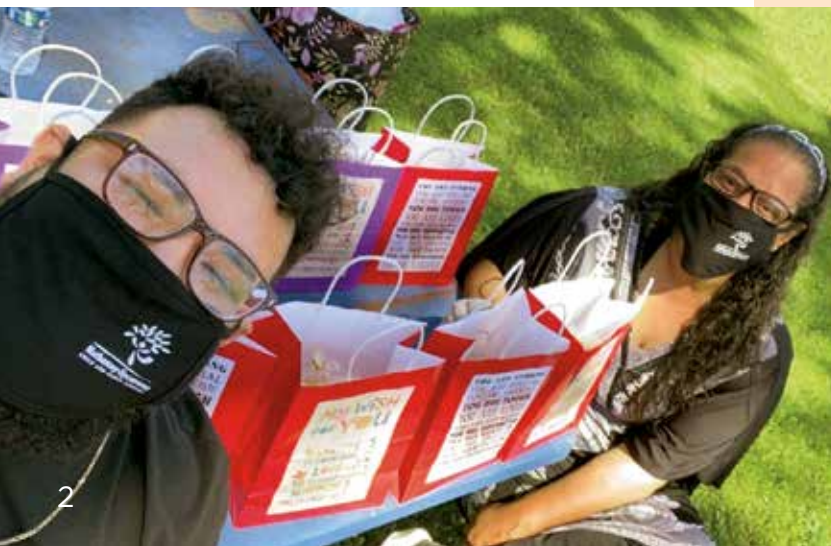
Hathaway-Sycamores Child and Family Services

PCF awards $100,000 in its first round of emergency response funding . Nine organizations receive grants to provide food and supplies to vulnerable seniors, individuals, and families. The Foundation also releases restrictions on 2019 grants, providing another $172,300 in emergency funding .