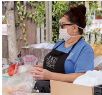
Union Station Homeless Services

Pasadena Community Foundation launches COVID-19 Response Fund with a $100,000 gift from the Foundation. PCF begins accepting private donations to build the fund and announces upcoming support for local nonprofits serving those impacted by the pandemic.