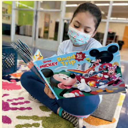
A young reader at Boys & Girls Club Pasadena