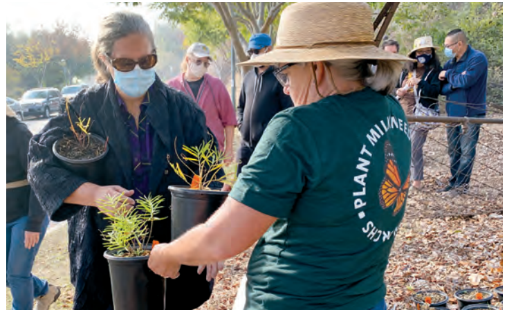
A local resident adopts three native milkweed plants during an AFC workshop in October 2021.

PCF's grant helped AFC purchase native milkweed plants and seeds for an intensive planting process and five "adoption" events in October and November. Nearly 300 people became proud participants in the Monarch Recovery Program, adopting 835 Asclepius fascicularis (Narrow-Leaf Milkweed) or Asclepius eriocarpa (Woolly-Pod Milkweed) to plant in their own yards.