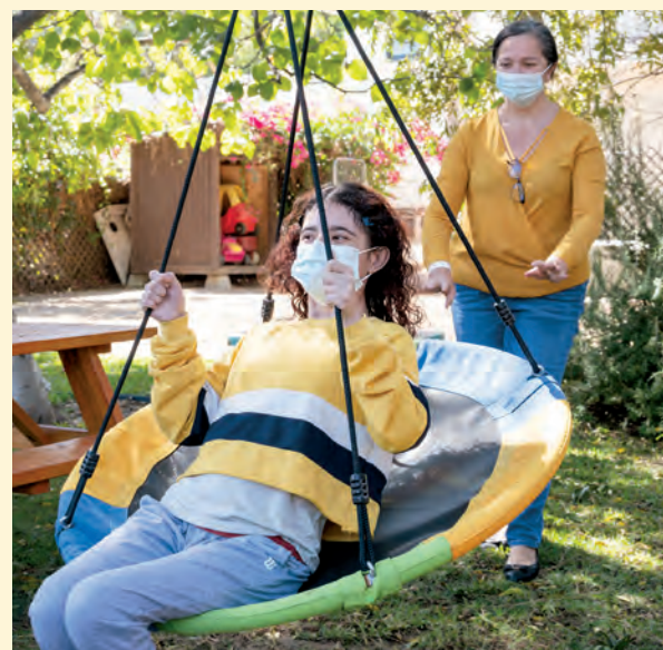
A young resident at Pasadena's Ronald McDonald house enjoys an afternoon outdoors with her mother.